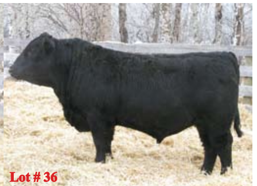
Lot # 36