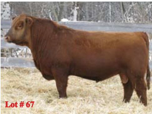
Lot # 67