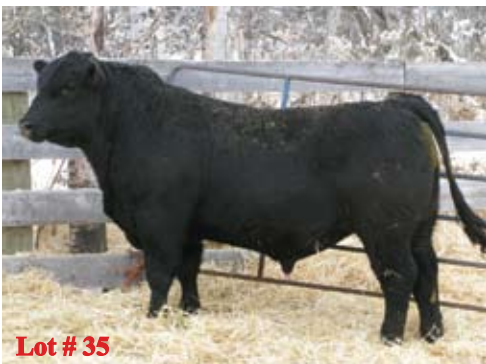
Lot # 35