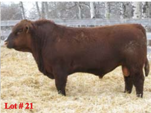
Lot # 21