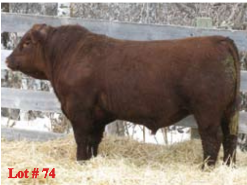
Lot # 74