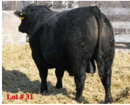
Lot # 31