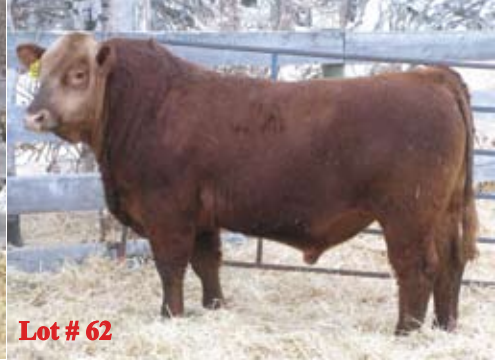
Lot # 62