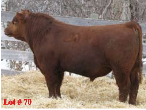
Lot # 70