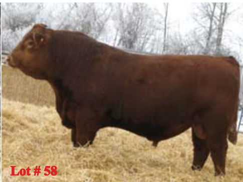
Lot # 58