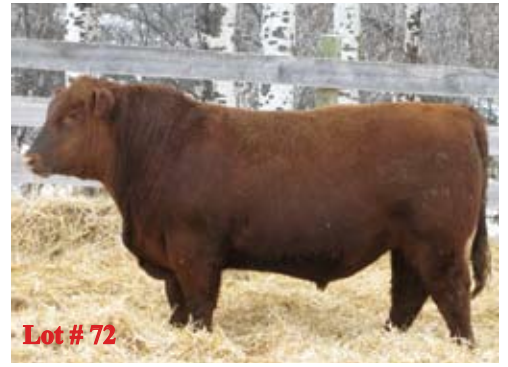
Lot # 72