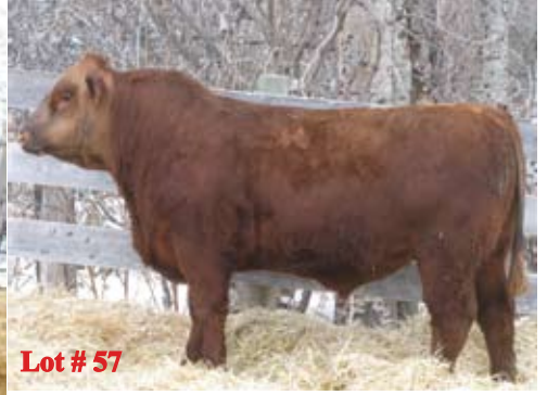
Lot # 57