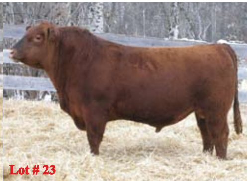
Lot # 23