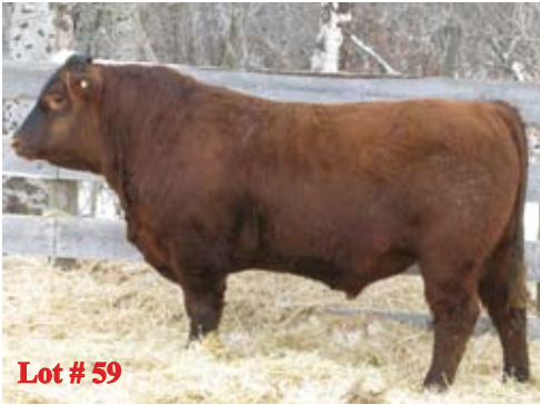
Lot # 59