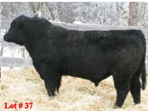
Lot # 37