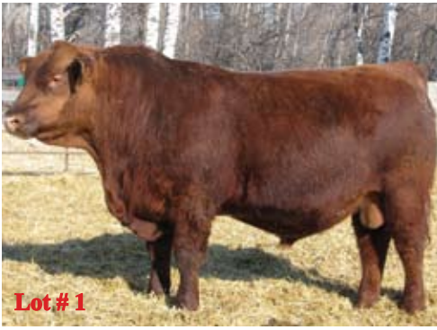
Lot # 1